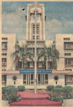
NIT-Tiruchi ranked No. 1 for the 10th year in a row. FILE PHOTO

Management, Tiruchi, climbed up to the 16th spot, from last year's 27th, among the top 100 management institutions in the country while the Bharathidasan Institute of Management dropped two ranks to secure 96th position.