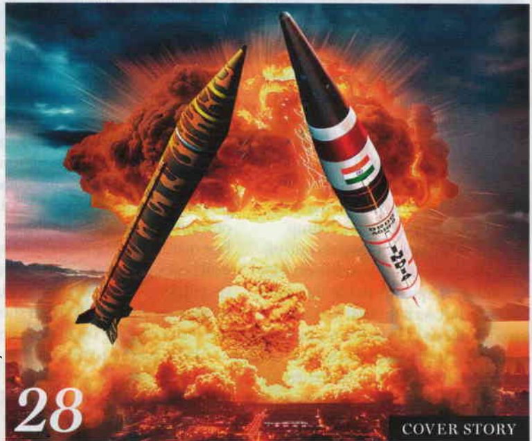
Illustration by NILANJAN DAS

STATE SCAN: NITISH PLAYS THE NAME GAME PG 20