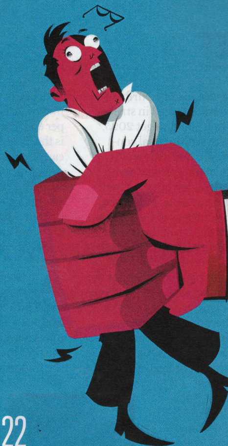
Illustration by SIDDHANT JUMDE

High inflation, taxes and a wage slump have hit this crucial demographic of 570 million Indians. What Budget 2025 can do for their economic revival