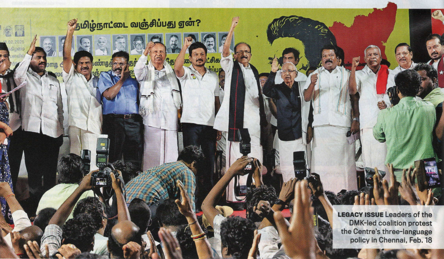
LEGACY ISSUE Leaders of the DMK-led coalition protest the Centre's three-language policy in Chennai, Feb. 18