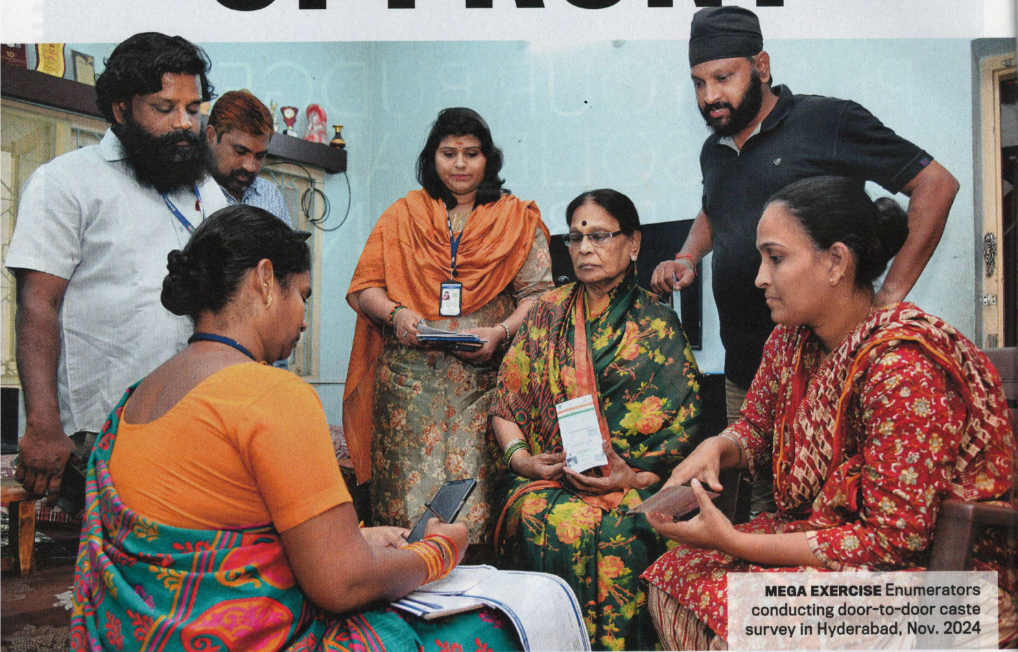
MEGA EXERCISE Enumerators conducting door-to-door caste survey in Hyderabad, Nov. 2024