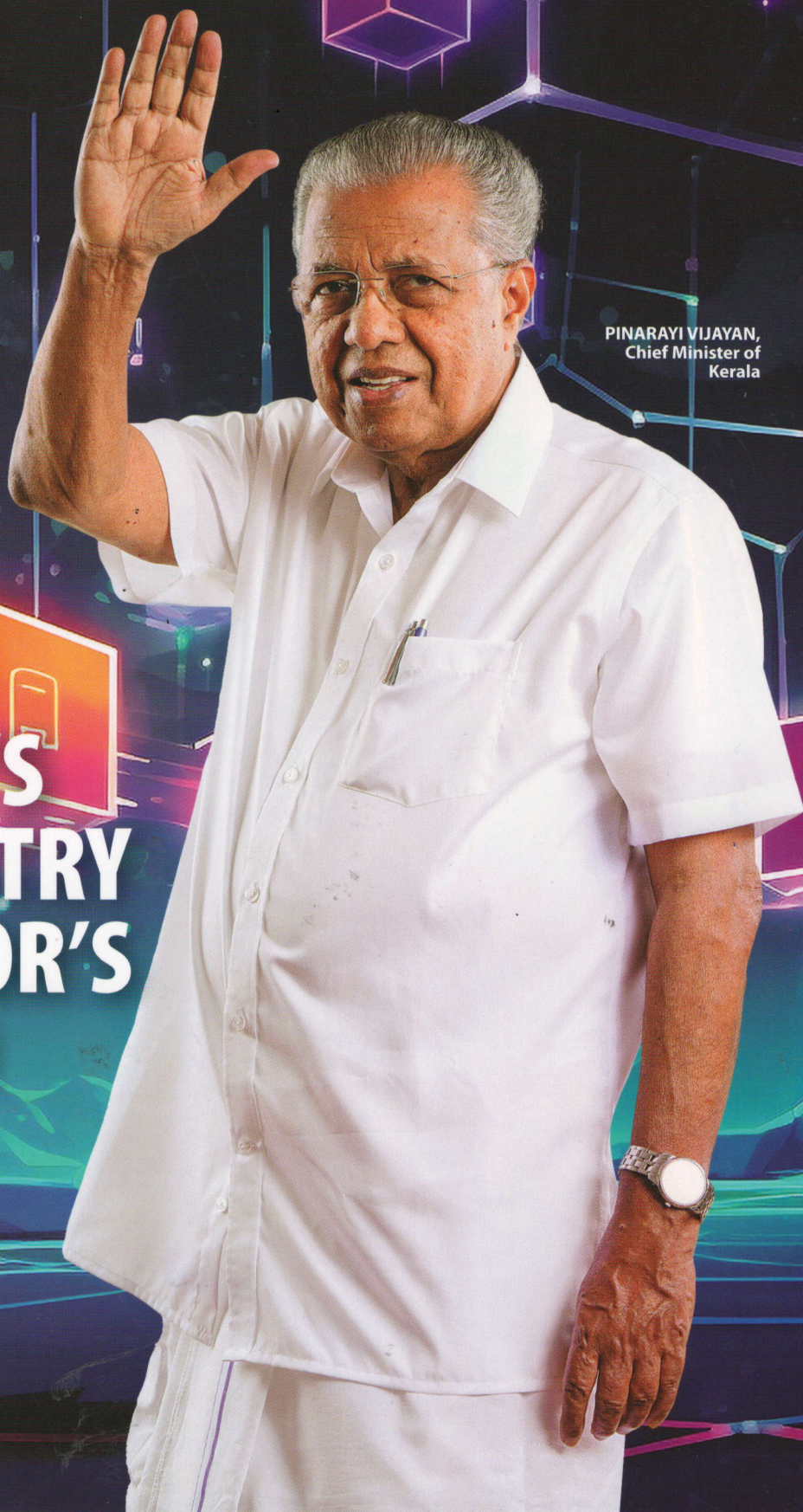
PINARAYI VIJAYAN, Chief Minister of Kerala

SUBSCRIBER'S COPY NOT FOR RESALE | RNI NO. 39847/81 | 22 FEBRUARY 2025