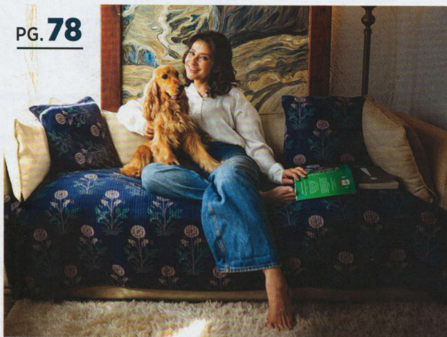
Manisha Koirala made her OTT series debut with Heeramandi