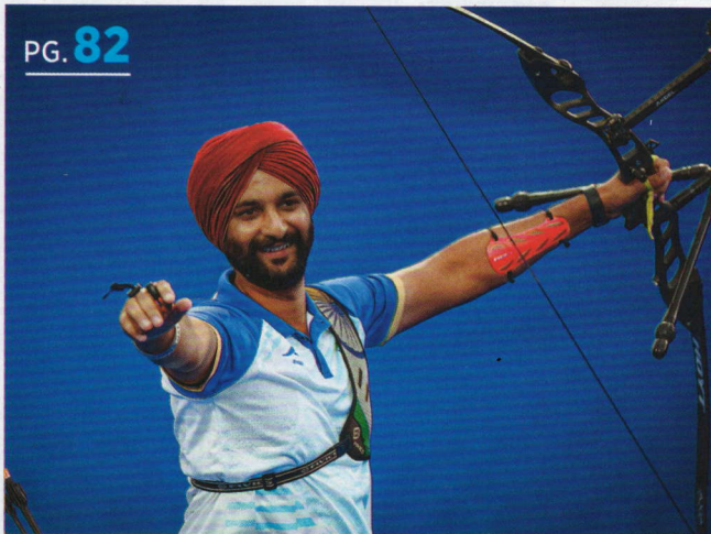
Harvinder Singh won the Men's Individual Recurve Open Gold Medal at the Paris 2024 Summer Paralympic Games