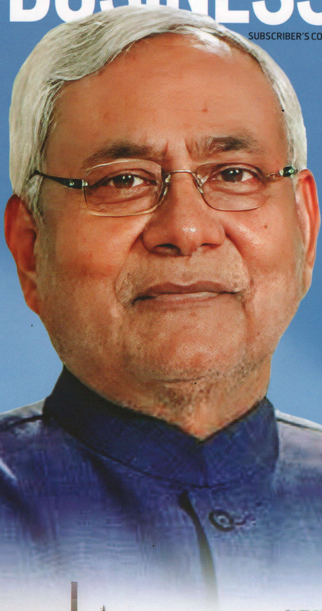
NITISH KUMAR, Chief Minister, Bihar