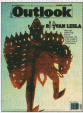
Outlook issue October 21, 2024