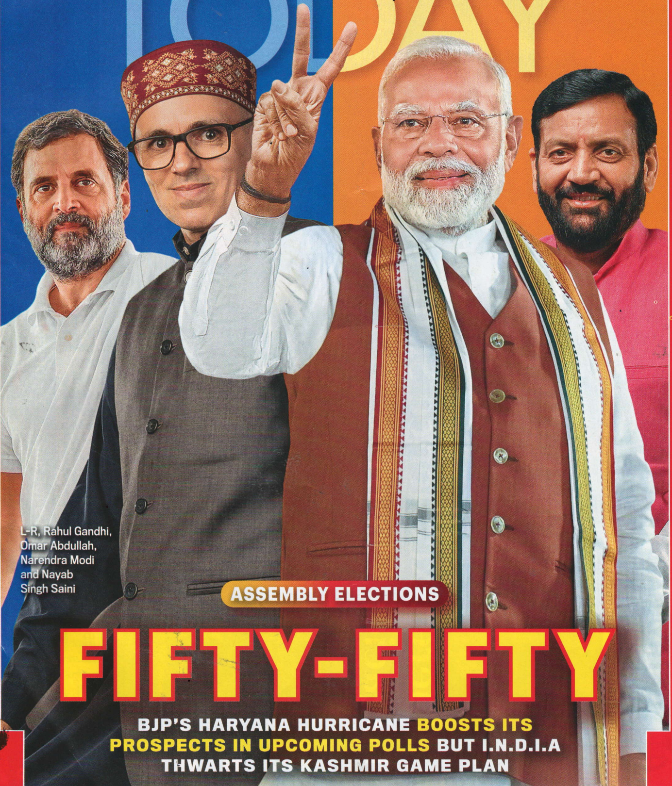
L-R, Rahul Gandhi, Omar Abdullah, Narendra Modi and Nayab Singh Saini