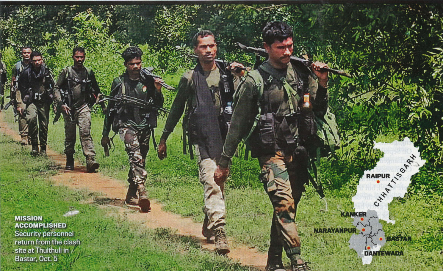
MISSION ACCOMPLISHED Security personnel return from the clash site at Thulthuli in Bastar, Oct. 5