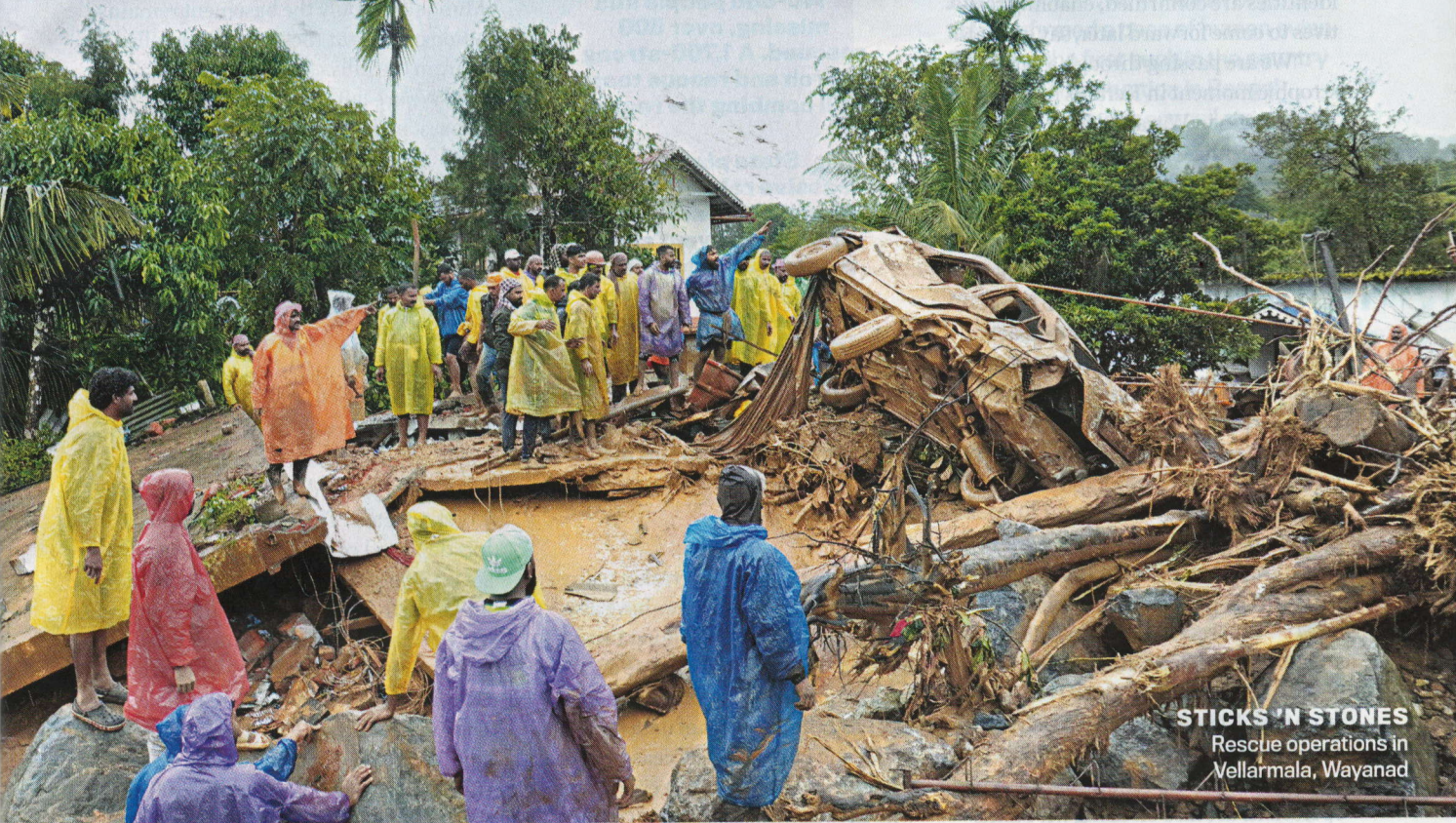
STICKS 'N STONES Rescue operations in Vellarmala, Wayanad

INDUS WATERS TREATY: BRIDGING DIVIDES PG 16