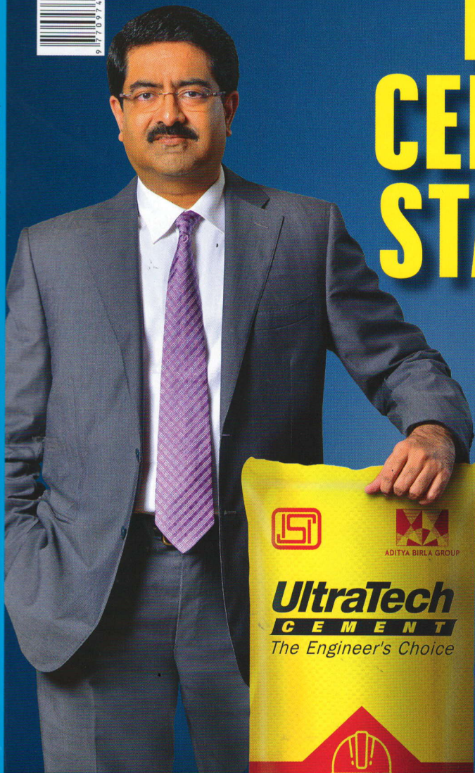
KUMAR MANGALAM BIRLA CHAIRMAN, ADITYA BIRLA GROUP