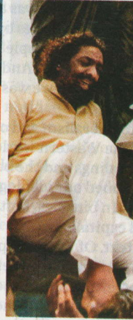
18 | LEFT, RIGHT & CENTRE A young Shibu Soren, Jharkhand Mukti Morcha