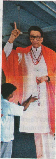
14 | SENA VS SENA Cutout of Bal Thackeray, Shiv Sena