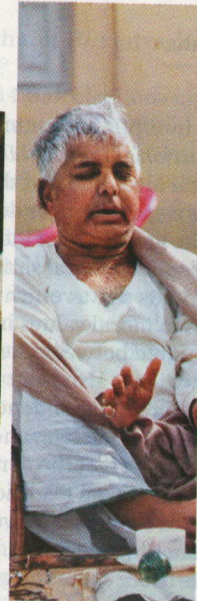
25 | MAVERICK POLITICIAN Lalu Prasad Yadav, Rashtriya Janata Dal