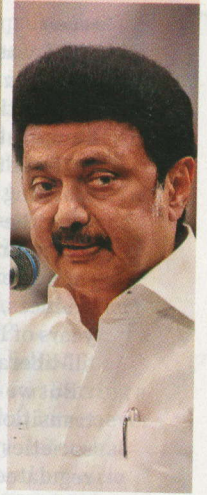
31 | SOUTHERN SAMRAT M K Stalin, Dravida Munnetra Kazhagam

"It was the best of times, it was the worst of times, it was the age of wisdom, it was the age of foolishness, it was the epoch of belief, it was the epoch of incredulity, it was the season of Light, it was the season of Darkness, it was the spring of hope, it was the winter of despair."