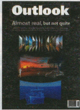
Outlook issue January 1, 2024