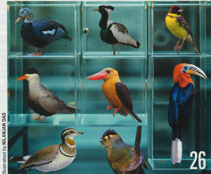
Illustration by NILANJAN DAS