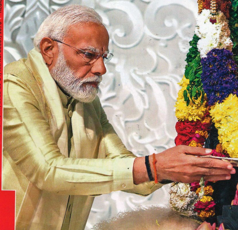
PM Narendra Modi at the consecration of the Balak Ram idol in Ayodhya, Jan. 22

DL (US)-03/MP/2022-23-24; RNI NO. 28587/1975 REGISTERED NO. DL(MD)-11/6068/2024-25-26; LICENSED TO POST WPP NO. U(C)-88/2024-26; FARIDABAD/05/2023-25