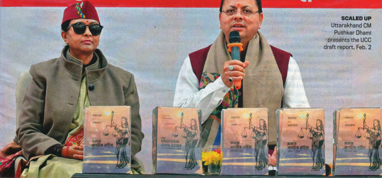
SCALED UP Uttarakhand CM Pushkar Dhami presents the UCC draft report, Feb. 2