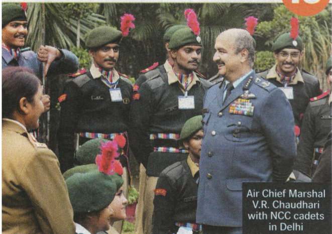
Air Chief Marshal V.R. Chaudhari with NCC cadets in Delhi